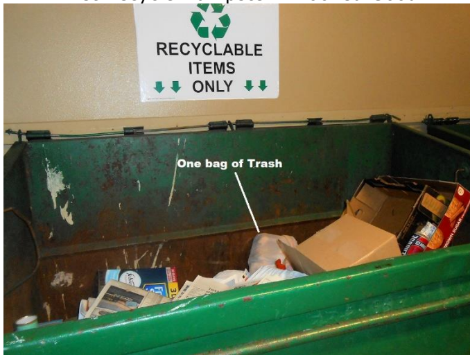
First Recycle Dumpster – Looked Good